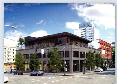
Rendering of completed project