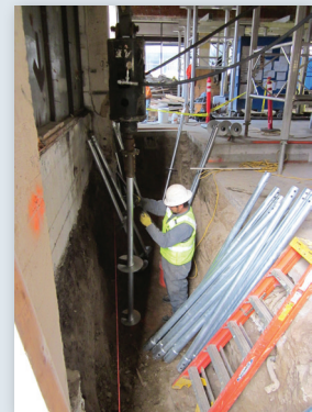
Aligning helical pile for installation