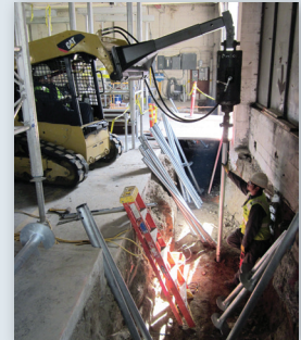
Installing vertical pile; equipment between temporary supports