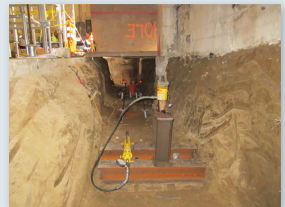
Tension test frame and equipment